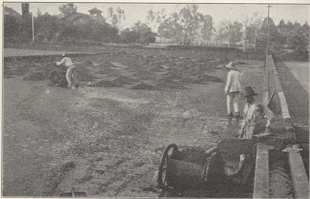
SPECIAL CARTS RECEIVE AND SPREAD THE COFFEE FROM THE WATER CANALS