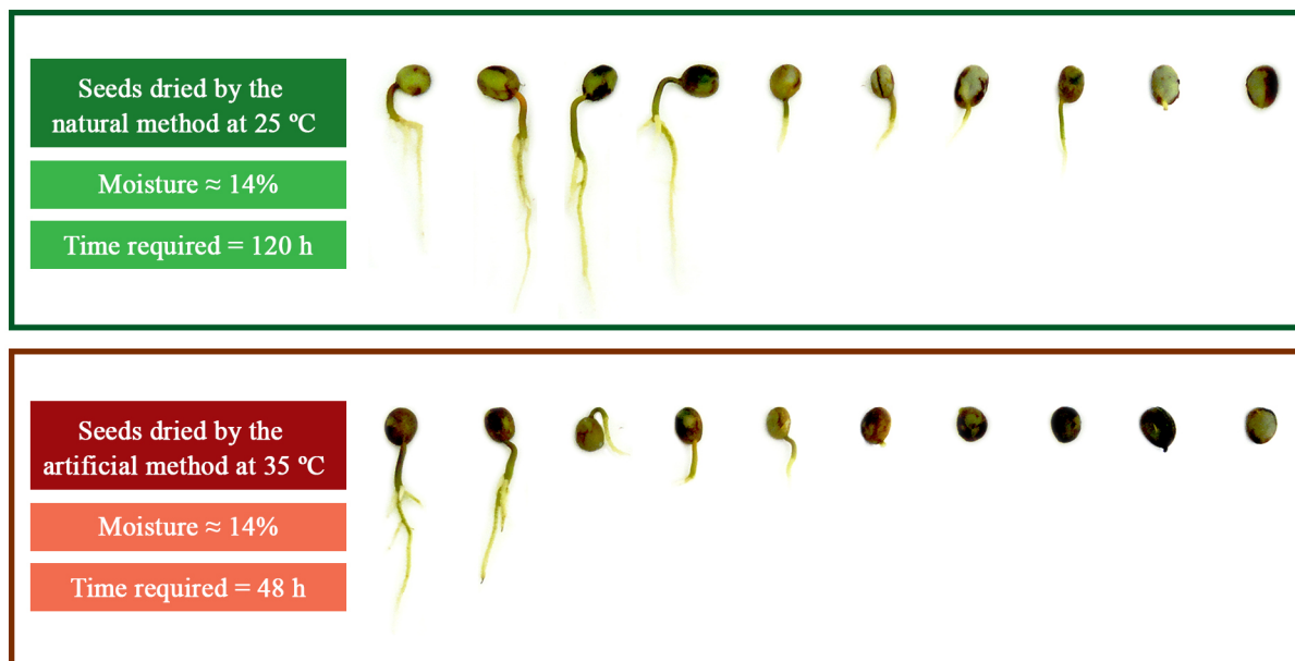
FIGURE 3 - Samples of seeds of genotypes of Coffea canephora Pierre ex A. Froehner, of late maturation (harvested in July 2017), 30 days after being dried (from 50% to 14% of moisture content) by natural (120 h of natural circulation of air at 25 °C) or artificial (48 h of forced circulation of air at 35 °C) methods (Marilândia, Espírito Santo State, Brazil).

Overall, it is possible to dry the seeds using both natural or artificial methods, but it is important to take the time of exposure and the speed of the water loss into consideration. Both methods were successfully used to remove the initial humidity without causing damages to the germinative potential, and the artificial drying was efficient in order to dry the seeds, requiring considerably less time. However, if it becomes necessary to decrease the moisture content to low levels, in order to enhance the storage, the speedy water loss from the artificial process may negatively affect the germination of the seeds and, therefore, the slow drying achieved by the natural method becomes more suitable.