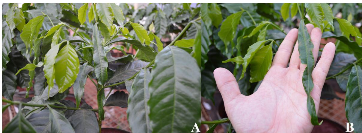
FIGURE 2 - (A) and (B) Leaf limb tightening in coffee plants submitted to the herbicide Glyphosate.