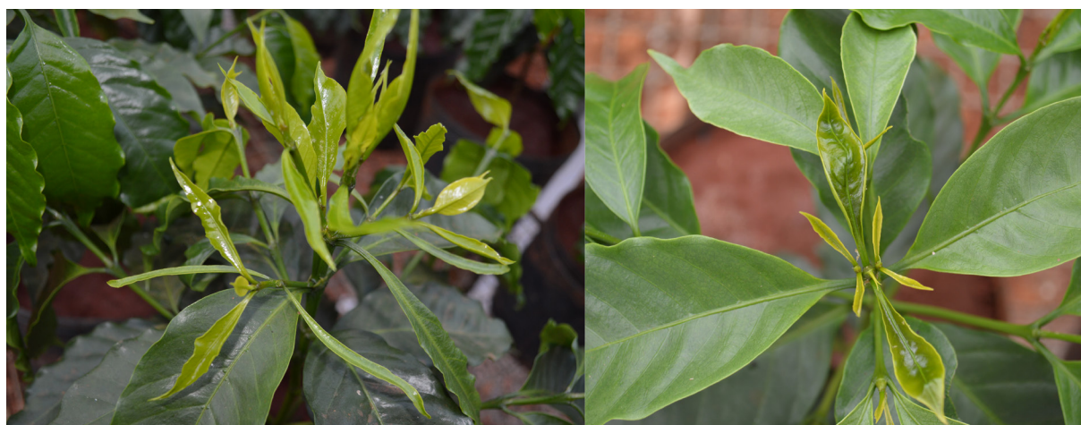
FIGURE 3 - Leaf limb tightening and excessive shooting in axillary bud regions in coffee plants submitted to the herbicide Glyphosate.