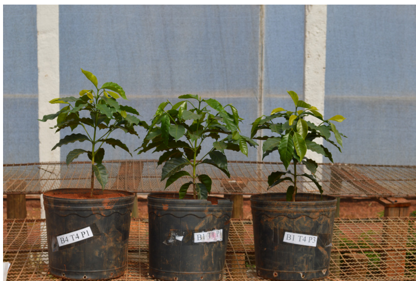
FIGURE 1 - Foliar chlorosis in the coffee growing regions submitted to the herbicide Glyphosate.